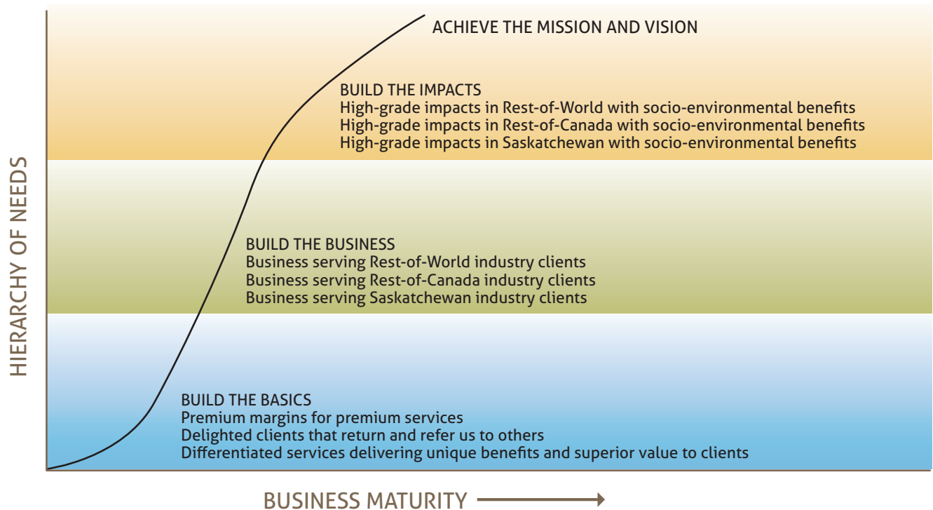
Figure 2. Business focus along the hierarchy of needs continuum.

clients, and business serving "rest-of-world" industry clients, and in that order of priority. Most, if not all, of the services we provide for industry clients will produce economic impacts, but we seek to optimize the economic impacts that result from our work. Therefore, for our mature lines of business, our business focus is "Build Economic Impacts," meaning that we strive to increase and enhance (high-grade) the impacts of our work for Saskatchewan, for the rest of Canada, and for the rest of the world, in that order of priority and in all cases meaning economic impacts with associated socio-environmental benefits.