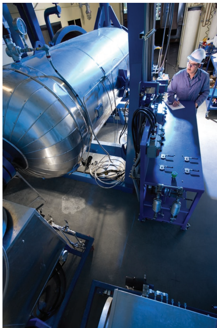
3-D physical model