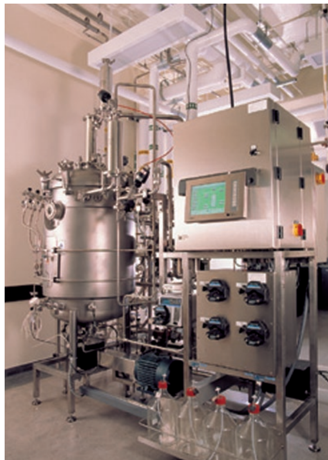
Fermenter for large-scale microbial culturing