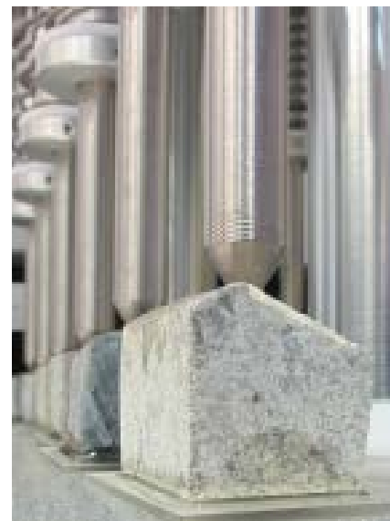
The Advanced Microanalysis Centre™ at the Saskatchewan Research Council (SRC) offers a variety of services using state-of-the-art equipment to support the requirements of the exploration and mining industries.