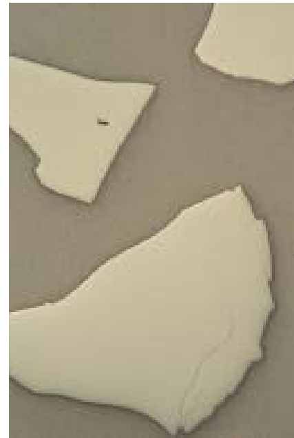
Kimberlite indicator mineral grains (garnets) in a polished block for electron microprobe analysis.

All prices listed are subject to change without notice.