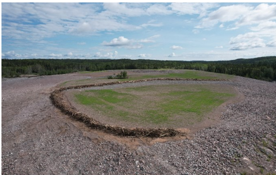
Successful revegetation shown on the completed tailings cover on the east waste rock pile (left)

This winter, the Gunnar team will report on 2023 season activities and plan for the 2024 work season.