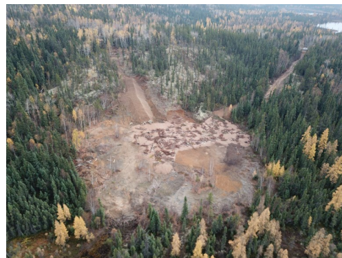
Remediation of soil gamma cover and backfill adit at Uranium Ridge

Of the 22 completed sites, seven have received the Ministry of Environment's Release from Decommissioning and Reclamation, and four have been transferred to the provincial Institutional Control Program.