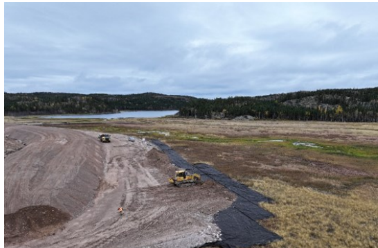
Stockpiled material at Langley Bay Tailings (right)

The Gunnar Central Tailings channel was completed in 2023, and the Langley Bay Tailings channel is mostly complete with minor bed-rock blasting required for completion.