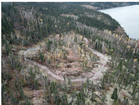
Perimeter fence at Murmac Mine

At these sites, historical debris was removed and/or buried, the areas with elevated gamma radiation levels were mitigated and the hazardous underground mine workings at Tena Claim were collapsed and secured with a remediation perimeter fence.