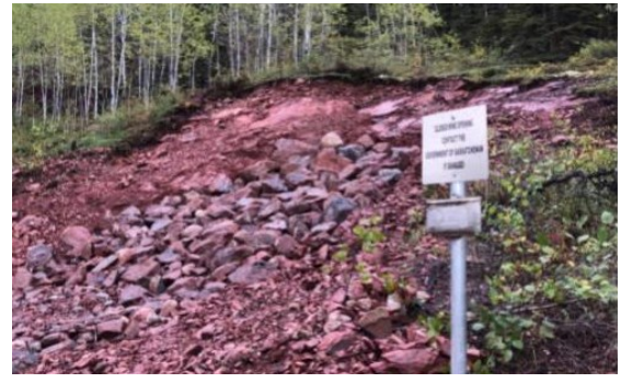
Adit 2 backfilled with rocks at Nesbitt Labine ABC Mine. The coarse material will allow drainage of mine water and prevent it from accumulating inside the mine.