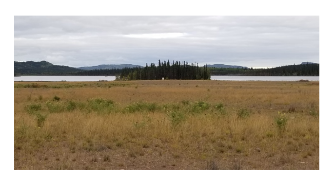
Congratulations to Denise Powder for winning the Lorado Mill photo contest with the above photo!

Nero Lake's water level was high in 2021 and the spillway flowed for the first time since its construction in 2006. SRC is monitoring for caragana, an invasive and unwanted plant species originally found in the organic debris placed on the tailings cover. The caragana was eliminated and is no longer present at site.