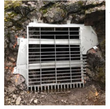
Stainless-steel grate installed at Meta Uranium Mines, Beaverlodge Lake, Umisk Island. The larger gap at the top of the grate is designed to allow bats in and out of the mine.

A risk assessment and a study of local wetlands were initiated at Lorado Mine, Uranium Ridge and Rix-Athabasca Smitty Mine to better understand the risks and environmental impacts of past mining at, and adjacent to, the sites. Once the information is available, SRC will consult with local communities to determine the