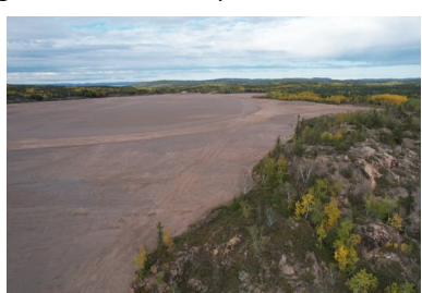
Completed Gunnar Main Tailings cover