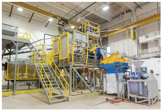
Completion: Physical installation of Kimberlite Ore Processing Facility