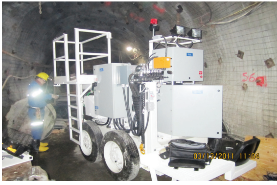
Underground Up-hole Ore Mapping System