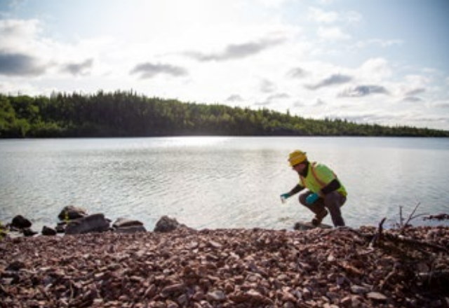
Collecting water samples at abandoned mines sites in northern SK