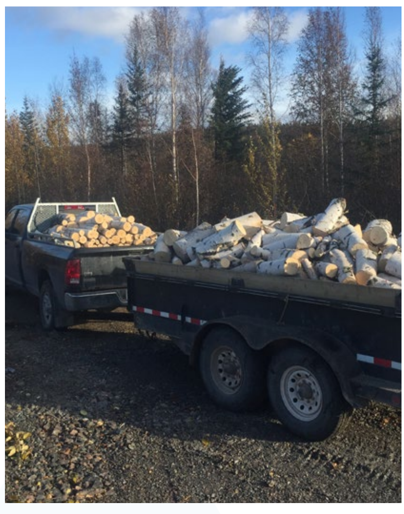
Project CLEANS firewood for Elders