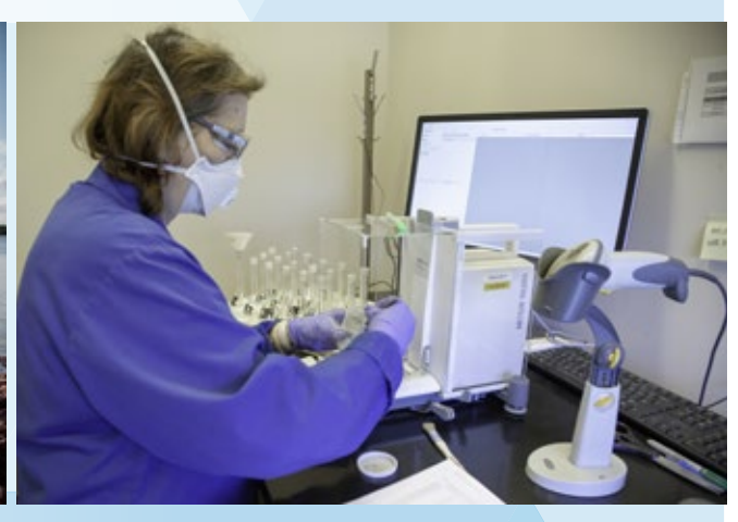
Analyzing samples at SRC Geoanalytical Laboratories