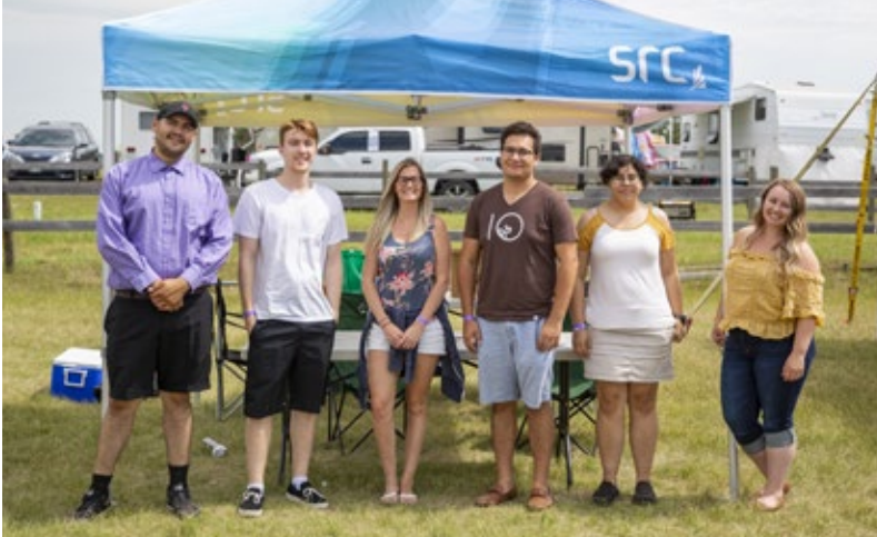
AMP Students Visit Batoche