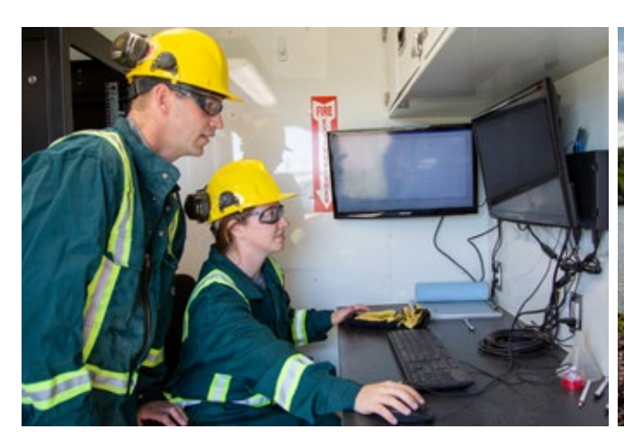
Centre for the Demonstration of Emissions Reductions mobile facility

Here's what we found out about the type of work they do, and what it's like to live a life of science.