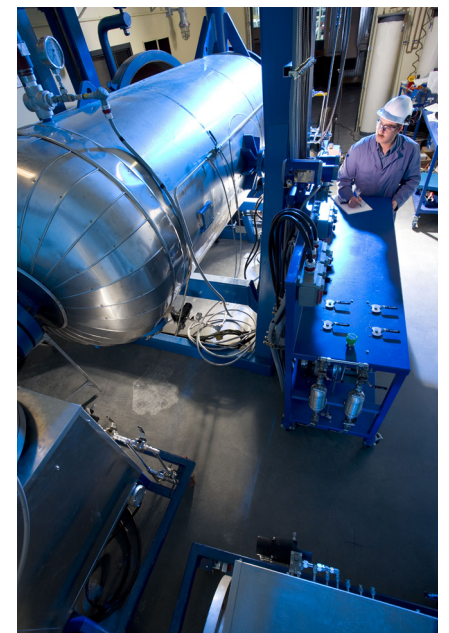
3D physical model