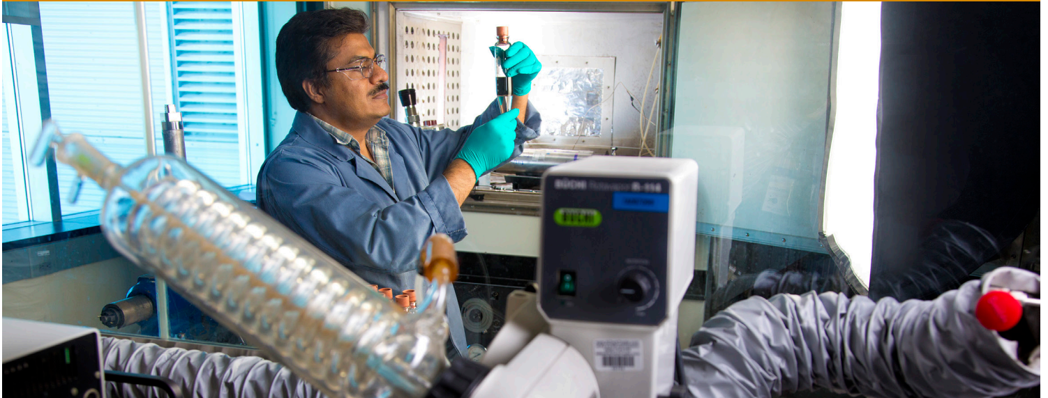
Processing production fluids