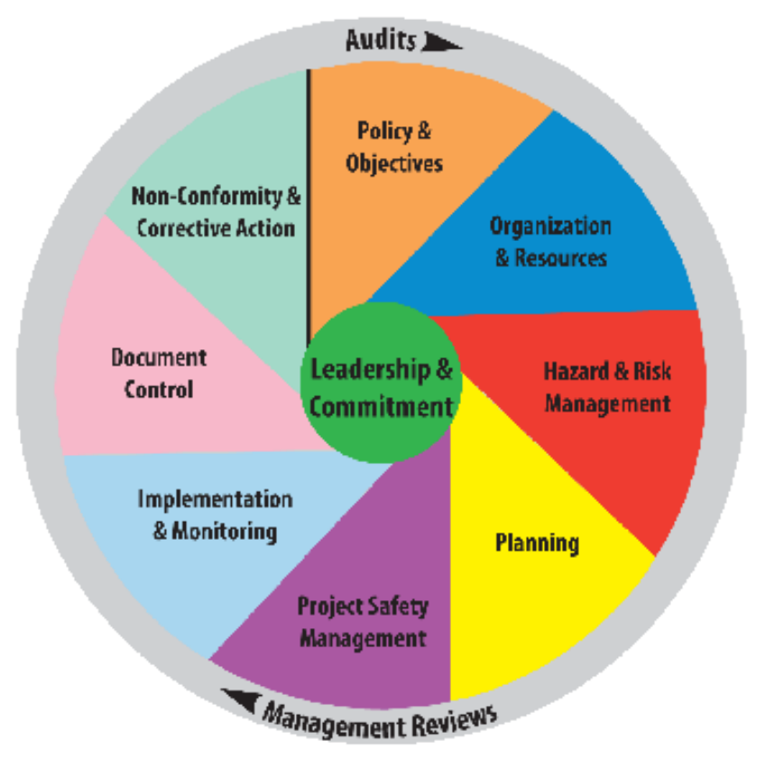
Figure 2: SRC OH&S Management System.

At the core of SRC's OH&S Management System is the most important element, "Leadership & Commitment". The other elements around this core element indicate that they are driven by management leadership and commitment. The "Hazards and Risk Management" element recognizes radiation safety as one of the critical risks along with other health and safety risks of SRC activities. The Audits and Management Reviews serve to monitor all the elements and to provide recommended actions for continuous improvement of the OH&S Management System.