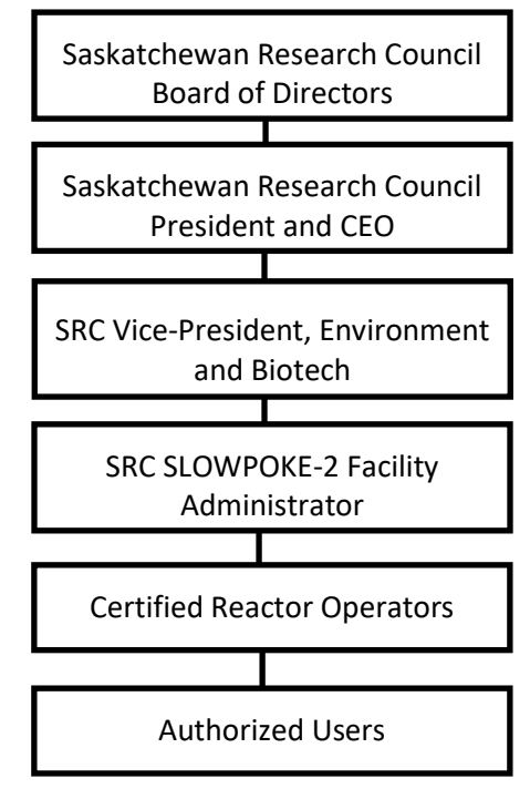
Figure 1: Levels of Management Control Responsibility for the Saskatchewan Research Council SLOWPOKE-2 Facility.